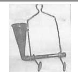
This bit was once featured in a Sears catalog.