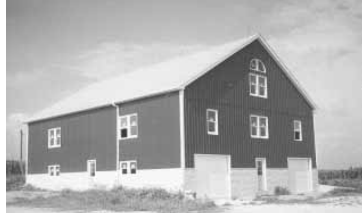
The barn as it looks today. The crumbling old foundation was replaced with new concrete and the barn was sided and roofed with steel siding.

The old barn as it looked four years ago before Pomberg and associates began work.