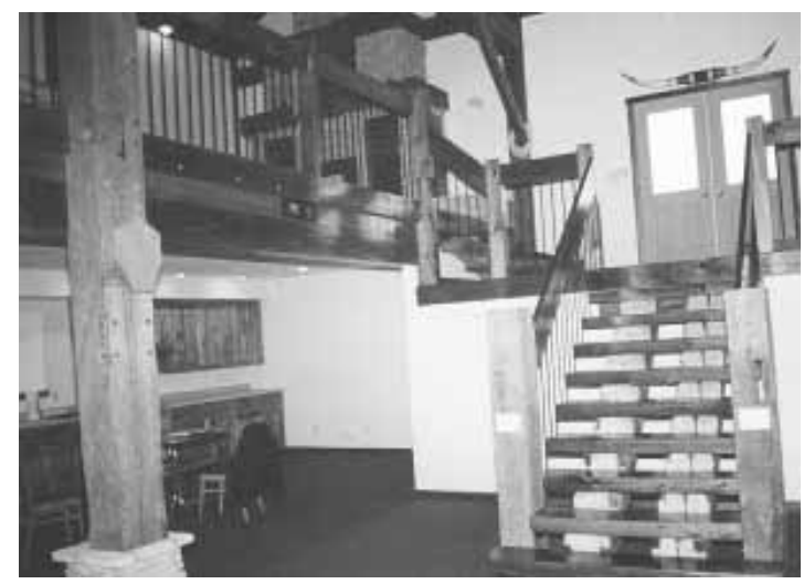
All original beams, rafters and sheeting were retained inside.