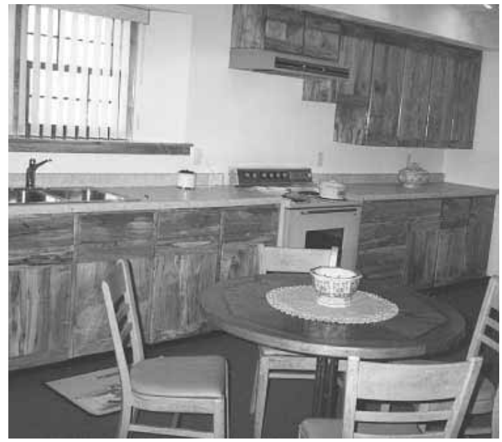
The kitchen features cabinetry made out of wood salvaged from the old barn. 22 • FARM SHOW

Contact: FARM SHOW Followup, John Pomberg, 1586 265th Ave., West Point, Iowa 52656 (ph 319 837-6040).