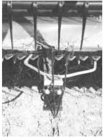
Plastic whiskers are heat-treated and shaped so they bounce right back into place.

Contact: FARM SHOW Followup, Tri-R Innovations, Inc., 628 S. Sangamon, Gibson City, Ill. 60936 (ph 217 784-8495).