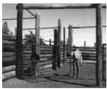
Poles are stacked on top of each other to make sides.

Poles are stacked on top of each other to make sides. They're held in place by vertical poles set in the ground on either side. Gate openings are reinforced by horizontal cross pieces. Swinging gates are made from heavywalled steel tubing covered with mesh wire panels. (Draft Horse Journal)