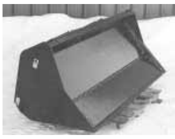
Pusher plate hydraulically moves forward to eject bucket's contents.

"It works great to clean out sticky materials that would otherwise cling to the bucket," says inventor Ron Berg, noting that Erskine Mfg. is marketing the unit. "It also increases the bucket's operating reach by 1 1/2 ft. and operating height by 2 ft. which allows you to load bigger trucks or spreaders and do it from one side. Overall, it can increase productivity by 15 to 30 percent depending on the situation. Another advantage is that the bucket never has to extend inside