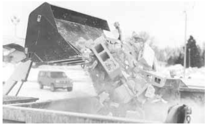
Self-cleaning loader bucket extends reach by 1 1/2 ft. and operating height by 2 ft.

Contact: FARM SHOW Followup, W.H. Smale Co. Ltd., 4583 Putnam Road, R.R. 2, Mossley, Ontario, Canada NOL 1V0 (ph 519 269-3754; fax 3795).